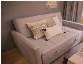
( https://timesproperty.com/news/post/saving-sofa-designs-for-small-living-spaces-blid6746 )

By : Times Property (Mailto:C-Rishika.Butwani@Timesgroup.Com) 14 FEBRUARY, 2024