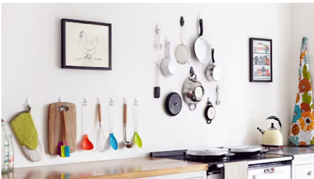
( https://timesproperty.com/news/post/hanging-hook-types-and-installation-tips-blid6766 )

Introduction Hanging hooks are versatile tools that serve various purposes in both residential and commercial spaces. From organising clutter... ( https://timesproperty.com/news/post/hanging-hook-types-and-installation-tips-blid6766 )