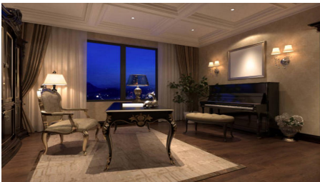
( https://timesproperty.com/news/post/home-office-paint-colour-trends-in-2024-blid6765 )

By : Times Property (Mailto:C-Rishika.Butwani@Timesgroup.Com) 14 FEBRUARY, 2024